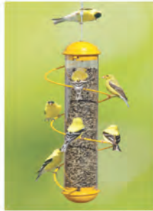
SE979 17" Yellow Spiral

When a parent returns to feed its young, its crop is full of partially digested seed (enough to feed the whole brood). Because of the amount of food brought each time, the young are only fed twice each hour. Perched at, and around, the feeders, Goldfinches eat seed after seed. It gives us a wonderful opportunity to watch them at greater lengths.