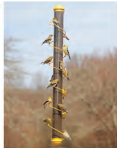
SEBQSBF5Y 36" Yellow Spiral Finch Tube

We love the Songbird Essentials Spiral Feeder as it has more openings per inch of feeder than standard "Perch Restricted" feeders. Also, its "Flip N'Fill™" feature means you can fill it from the top one time, and the bottom the next. This means seed never gets old in the bottom of the feeder, keeping your finches happy with fresher seed for them to eat.