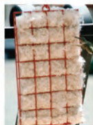
SE7021 Hummer Helper Material (Goldfinches love it too!)