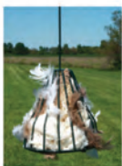
SEWF91010 Birdie Bell with Nesting Materials

You can encourage Goldfinches to nest in your yard by providing nesting material including the following: