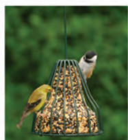
SEWF91011 Birdie Bell Only

Birdie Bells are all-weather cage holders. They are versatile enough to house either nesting material or seed bells and fruit! Nesting material refills are available. The image to the left shows how Birdie Bells can be utilized for holding seed bells, and birds love it!