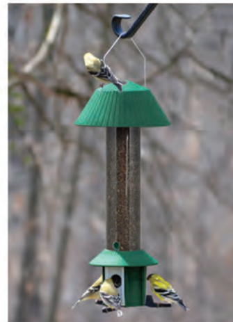
SE979 Squirrel Deflector Nyjer Feeder

Nyjer Seed resembles grains of wild rice and is coveted by Goldfinches for its high fat and protein content. Most Finches and some other birds enjoy a little Nyjer in their diet. Nyjer imported to the United States has been heated to prevent it from germinating so that seed sprouting is not a concern. Mixing Nyjer seed with fine chopped Sunflower Kernels reduces the mess on the yard and patio. Pine Siskins also like it better than straight Nyjer. All Finch mixes require a feeder with very small openings. Some of the best feeders for feeding Goldfinches are listed inside of this brochure.