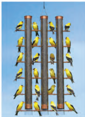
SE324C Copper Finches Favorite SE324 Red Finches Favorite

Many people come in and complain "Finches" don't eat the seed at the bottom. This happens when seed gets packed down and draws moisture when always filled from the top. Either get a Songbird Essentials feeder or remember to dump out and mix old seed in the bottom of the feeder with new seed and then refill. Either solution will help you attract more Finches.