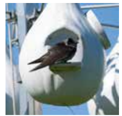
SE954 - Excluder Gourd

March 1. Purple Martin houses open for established colonies. April 1 -Purple Martin houses open for new colonies. April 15 - Hummingbird feeders up and filled. April 20 to May 1 - Oriole feeders up and filled. We used to always recommend May 1st for Orioles. However, during a couple of the past warm springs the Orioles have arrived earlier. More on Orioles and Hummingbirds in our next issue.