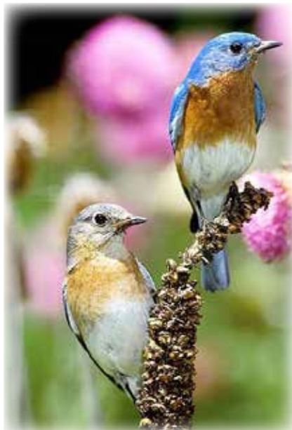
Eastern Bluebird Pair

"Mister Bluebird on my shoulder, it's the truth, it's actual, everything is satisfactual", is part of the classic Disney song "Zip-a-Dee-Doo-Dah" from the movie Song of the South. While it is unlikely a Bluebird would rest on one's shoulder, there is a great chance you can make this delightful bird part of your spring and summer by putting up a bluebird house in your backyard or field.