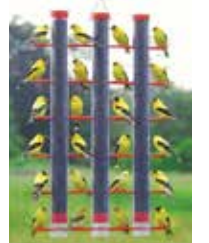
SE324-Finches Favorite 3 Tube Feeder