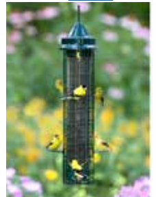
BD1016-Squirrel Buster Finch

A. You saved a lot of money because we always lock in seed at the lowest price in the fall for customers. We asked then, and we remind you now that all seed and suet paid for during the booking need to be taken from Songbird Station by April 1.