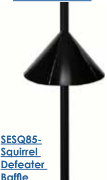
SESQ85-Squirrel Defeater Baffle

A. You are right. It seems squirrels quickly find new bird feeders. We will have an entire article on this challenge in the next issue! Our number one recommendation is to purchase one of the Brome Squirrel Buster models of feeders. They are squirrel proof. As one of Brome's largest accounts- no one, anywhere- beats our selection and prices. We stock all the models for sunflower mixes, suet, peanut, and finch mix. I gave my mom a squirrel buster for Christmas. We can also help you hang feeders you own on yard hooks and poles utilizing a Songbird Essential Squirrel Defeater baffle in such a manner that squirrels and even raccoons can't get to your feeders. Come in to the store, and we can show you how!