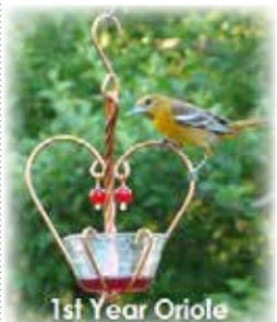
1st Year Oriole SEHHLBJL

Many species of young birds have a subsong that seems to be a rehearsal for the full, primary song that develops later. During the bird's first winter and early spring, the primary song is totally developed into a sequence of notes in a definite pattern that often is complex. A quiet rendering of the primary song, known as "whisper" or "muted" song, is often given by songbirds while sitting on the nest. Sometimes it is used when adult birds become slightly alarmed, sung by both males and females from a place of concealment in trees, shrubbery, or other cover.