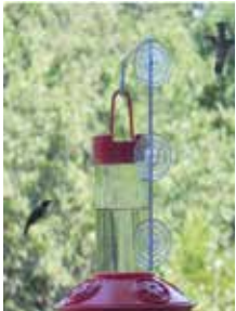
SE6002W - Dr. JB's Window Feeder