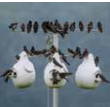
SELSGR- Gourd Rack

A. Yes-they do! In fact, that's how Native Americans attracted martins. We offer a couple of styles, but our favorite is the Songbird Essentials Excluder Gourd the Official Gourd of the Purple Martin Conservation Association. You can check nests and clean it through a side opening. Folks (& martins) love our Lone Star Gourd Racks especially because they are easy to lower. Martins love the connecting wires which offer sorely needed perching areas as TV antennas and electric wires overhead have become less common.