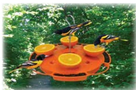
Oriole Fruit & Jelly Feeder

Hummingbirds go where the food is, both natural resources and in-home nectar provided. Putting out feeders in your yard is beneficial to you both as it helps offer them a reliable food source while attracting them to your yard for your viewing pleasure.