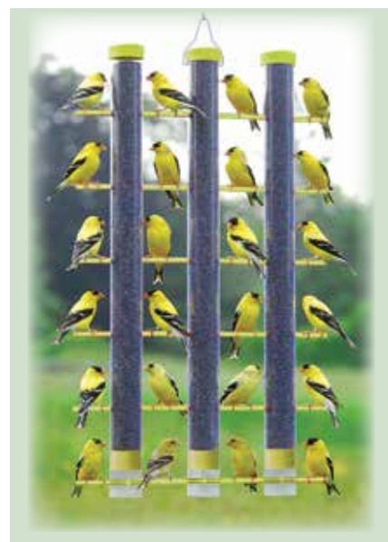
Finches Favorite Feeder SE324

when you simply "top off feeders." This old seed draws moisture and often gets moldy which is why birds don't like it. On feeders I use that don't fill from the bottom, I make a point each time to dump any leftover seed in the tube into a bucket and "mix it" with the fresh seed I'm putting out. Try this method I guarantee it will help you attract more finches to more ports on your feeder.