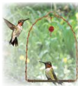
Copper Swing SEHHHUMS

There are two great products I recommend that will greatly add to your enjoyment of hummingbirds: