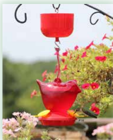
Red Bird Feeder SEBCO312