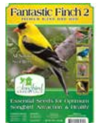
5 & 20lb Bags