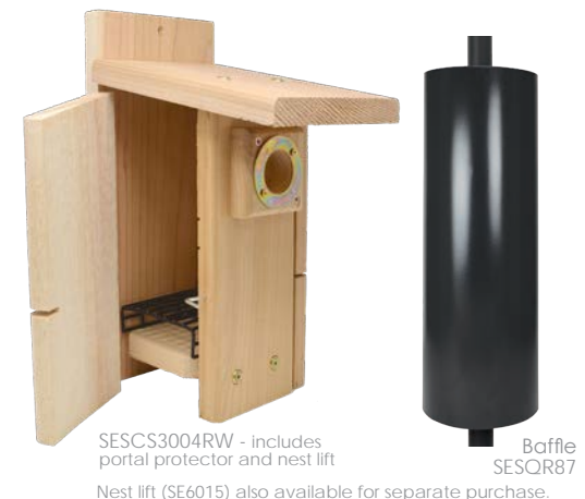
SESCS3004RW - includes portal protector and nest lift

Mounting the house on a tall pole with a baffle beneath is a great way to keep chicks out of harms way. Attach the pole to the back of the house, and place the baffle directly under the house for snake, raccoon, and cat control.