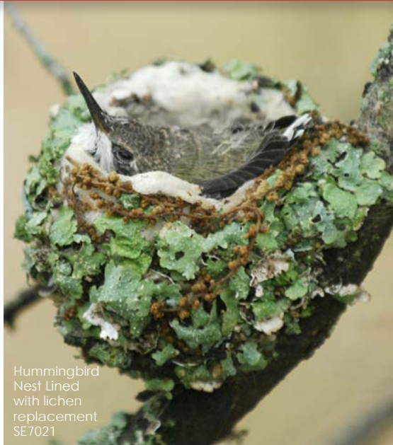
Hummingbird Nest Lined with lichen replacement SE7021

By far the most prevalent species is the Ruby-Throated Hummingbird. This Hummingbird is the only one found east of the Rocky Mountains. However, it has adapted well to human development and can be found anywhere there is shelter, space, and food. It is frequently seen in suburban backyards with mature trees and shrubs, in wooded parks, and around farmsteads.