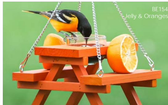
BE154 Jelly & Oranges