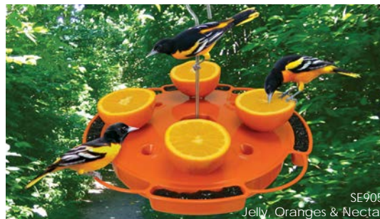
SE905 Jelly, Oranges & Nectar

If your desire is to offer a feeder where multiple birds may feed at the same time, consider a feeder that offers one or more deposits for jelly along with the option to